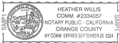
Place Notary Seal Above