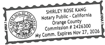
Place Notary Seal and/or Stamp Above

Signature [Handwritten Signature] Signature of Notary Public